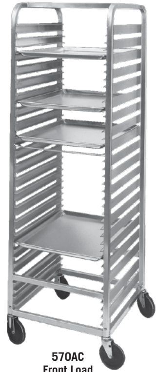
570AC Front Load