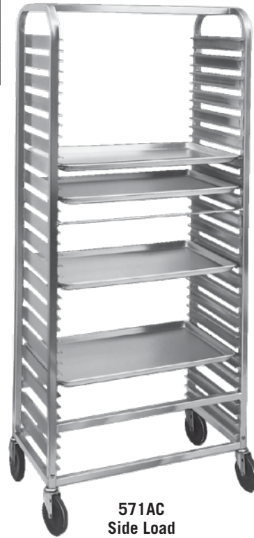
571AC Side Load