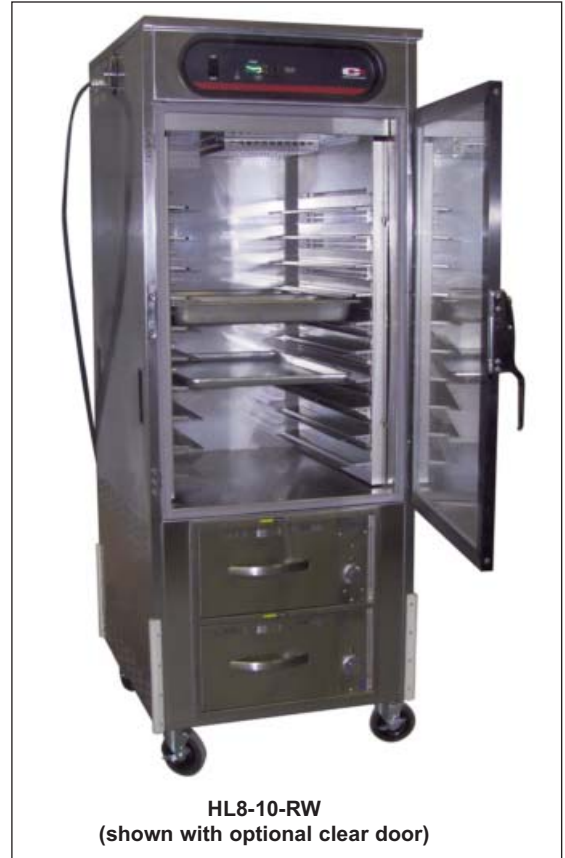
HL8-10-RW (shown with optional clear door)

EASY-TO-USE DIGITAL CONTROLS... Control heat with dial. Temperature range of 85°F to 200°F. Flashing display during preheat mode, turns solid when preheat mode is complete. Temperature display shows user setting. Press temperature dial to display actual temperature. Low temperature light with audible alarm.