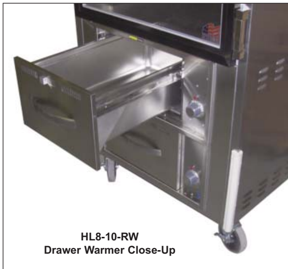
HL8-10-RW Drawer Warmer Close-Up

NARROW DRAWER WARMERS... Keep a variety of food hot and ready to serve. Stainless steel pan provided with each drawer accepts 12"x20" steam table pans up to 6" deep (end-loaded).