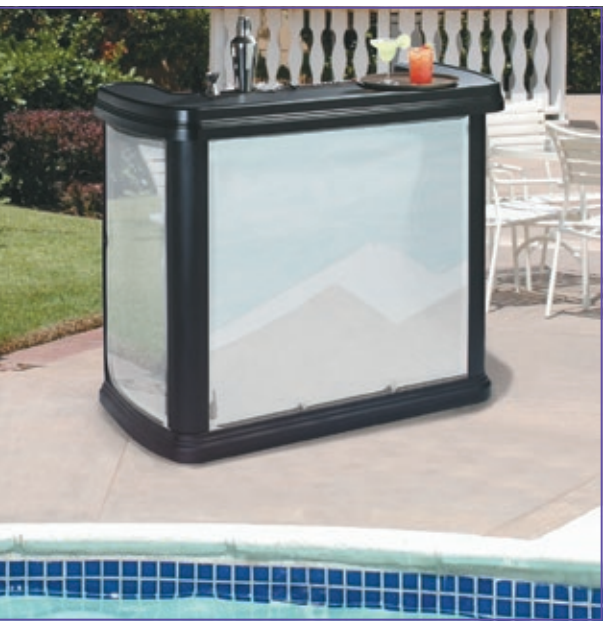
Durable Maximizer Portable Bar is perfect for outdoor service