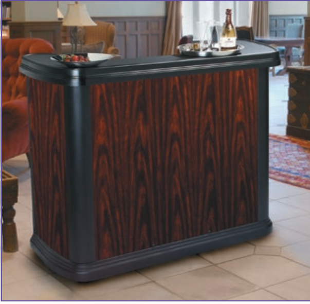
Maximizer Portable Bar's upscale styling is at home in any setting

Designed by bartenders, Maximizer Portable Bar's upscale styling fits in any setting to enable profitable, efficient bar offerings that delight your guests with their favorite libations.