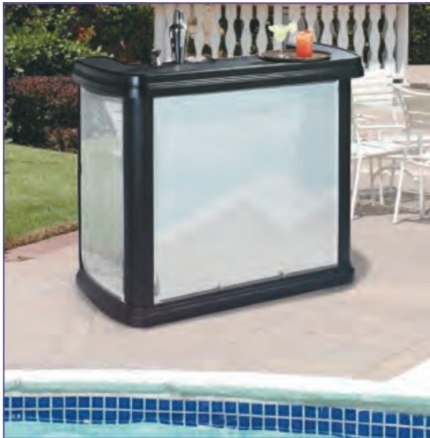
Durable Maximizer Portable Bar is perfect for outdoor service