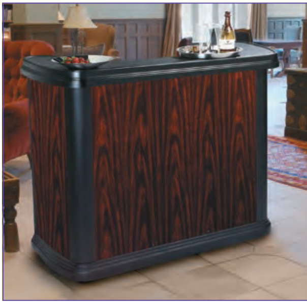
Maximizer Portable Bar's upscale styling is at home in any setting

Designed by bartenders, Maximizer Portable Bar's upscale styling fits in any setting to enable profitable, efficient bar offerings that delight your guests with their favorite libations.