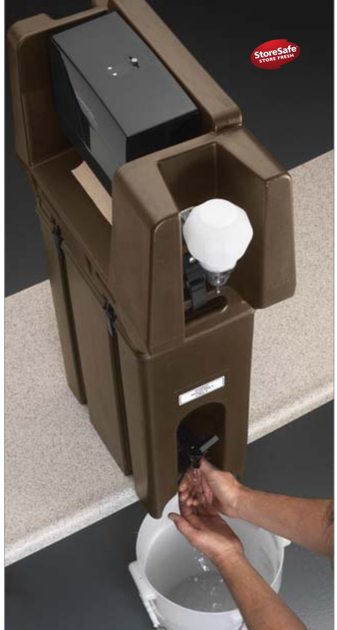
Shown with 500LCD Camtainer.