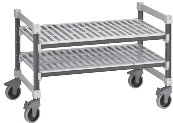
Mobile Undercounter Unit