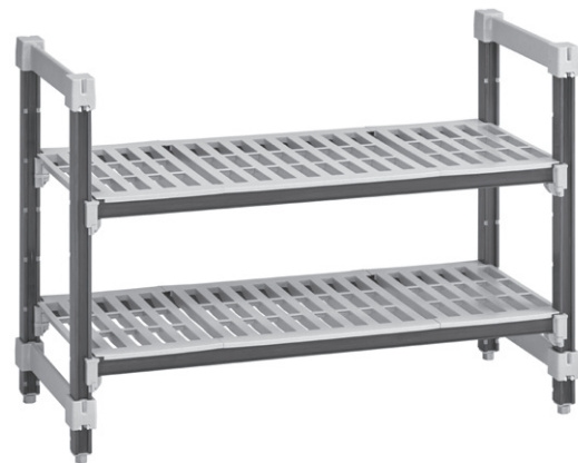
Stationary Undercounter Unit