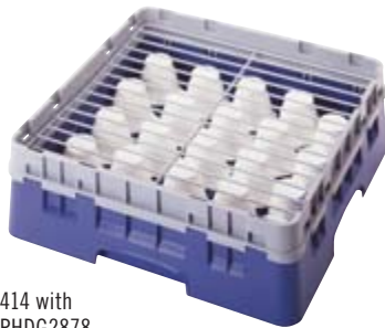
BR414 with CRPHDG2878

Keeps lightweight smallwares in place during wash cycle. Use on full size Camrack Base or Flatware rack.