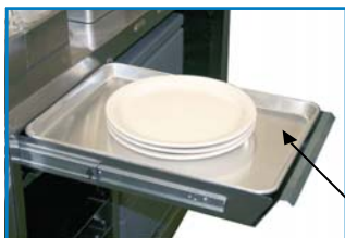
MobilServ® is a registered trademark of Cadco, Ltd.

Cart is open at back for easy access to drawers, shelves, & optional Cambro® Camcarrier®, Models UPC 400 or UPCH 400