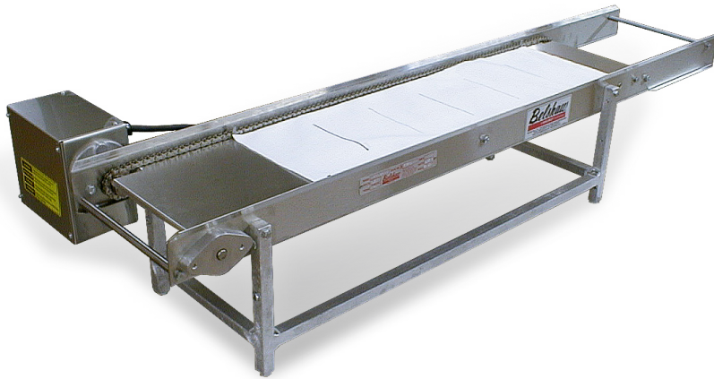
FT42 Feed Table