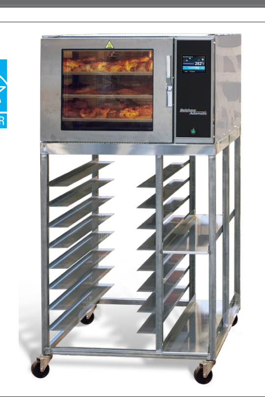
↑ BX3 Eco-touch, single stack w/stand