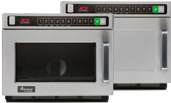
Left to right: HDC window door style and HDC solid door style (HDC18SD2)