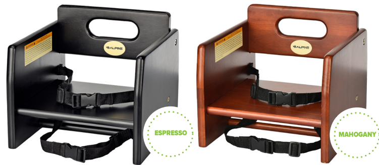
2 great color options available!