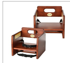
Available in 2-pack