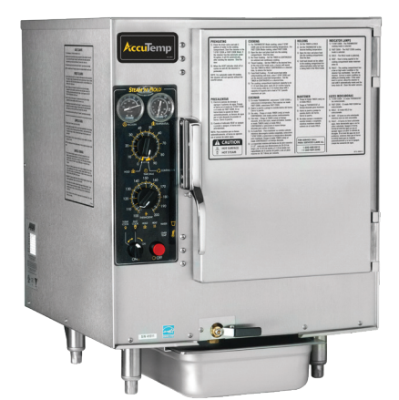
S6 Countertop Steam'N'Hold™ Steam Cooker shown with optional 4" adjustable legs and 4" drain pan