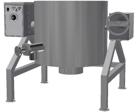
Model ALTLGB-20 shown with optional draw off valve

* Call AccuTemp for additional information